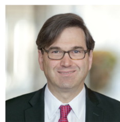
Jason Furman Harvard Kennedy School